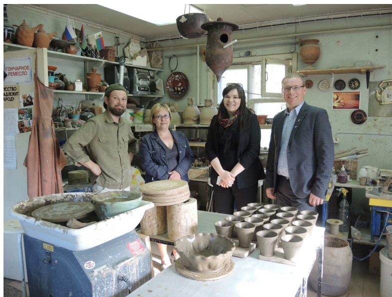
Art School in Olonets

Swedish colleagues attended meetings in the city of Petrozavodsk, municipalities of Pryazha and Olonets, visited Ethnic cultural center in Pryazha, art school in Olonets, as well as took part in the talks with the representatives of Kostomuksha and Medvezhyegorsk.