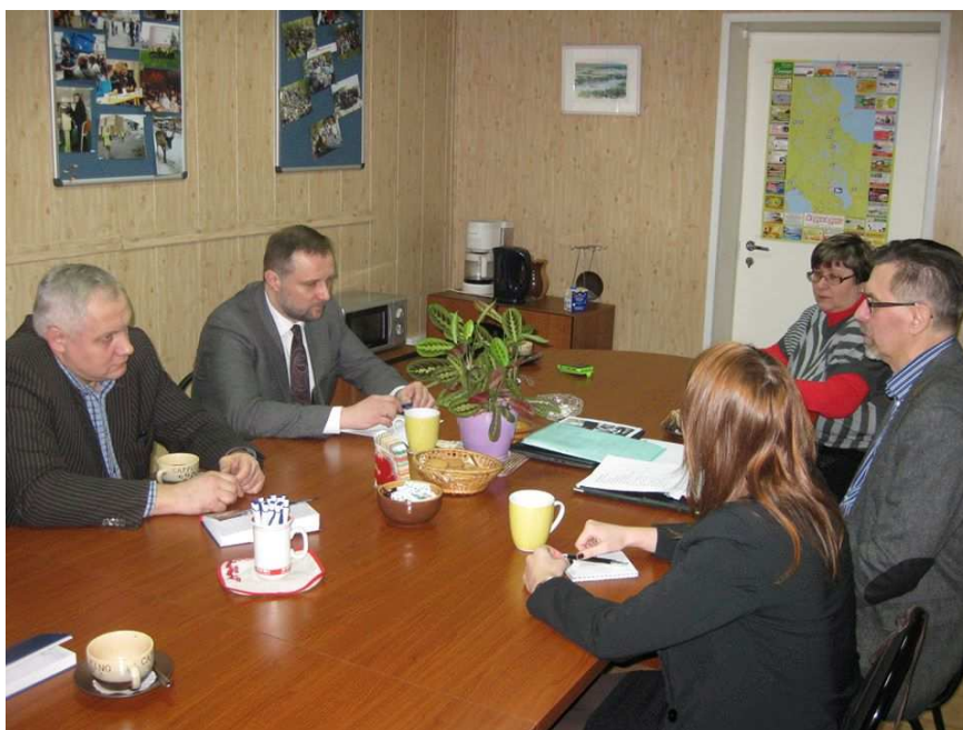
Discussing the plan of upcoming activities at SKBIC office

The draft plan was discussed and to be finalized in autumn 2015.