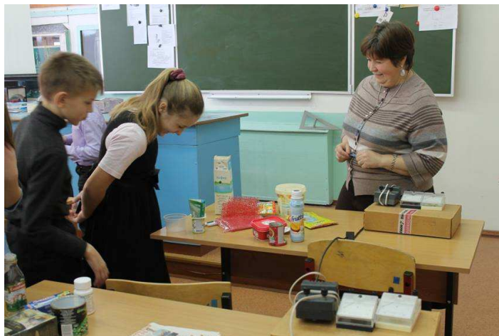
Waste sorting game for the local school kids